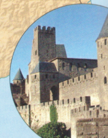
la cité de Carcassonne