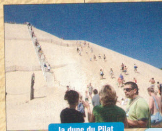
la dune du Pyla